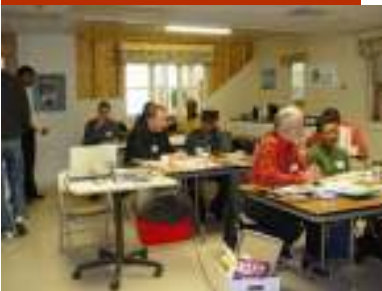
Participants at the Design 1st Clinic

Neighborhood Ventures held its initial Design 1st Clinic on December 5, 2007. Each business owner worked with architects and received free pictures showing how business building exteriors could be upgraded to make it appealing to customers and the community. Architects from the American Institute of Architects (AIA), and local designers participated. Also, presentations were made by the AIA, Macatawa Bank and the West Michigan Minority Contractors Association on aspects of building design, construction and financing.