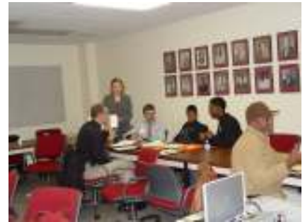
Southtown Alliance Conference: Business owners and stakeholders work together to promote Southtown

Additionally, the alliance will review commercial development, business expansion and zoning matters that are considered by the City of Grand Rapids Zoning Department and Economic Development Project Team. The alliance is also in the process of engaging in cooperative marketing and corridor improvements initiatives.