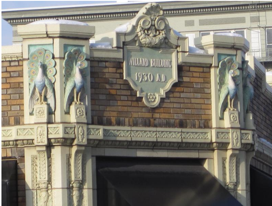
The "Peacock Building" - Heartside

Having trouble viewing this email? Click here