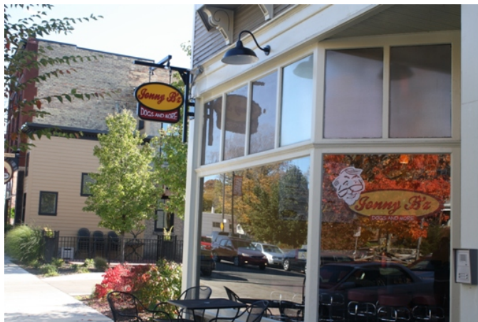
Johnny B's Dogs-n-More on Wealthy Street SE

Having trouble viewing this email? Click here