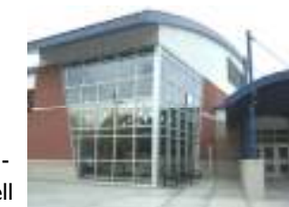
People's Choice Awards for Best New Construction