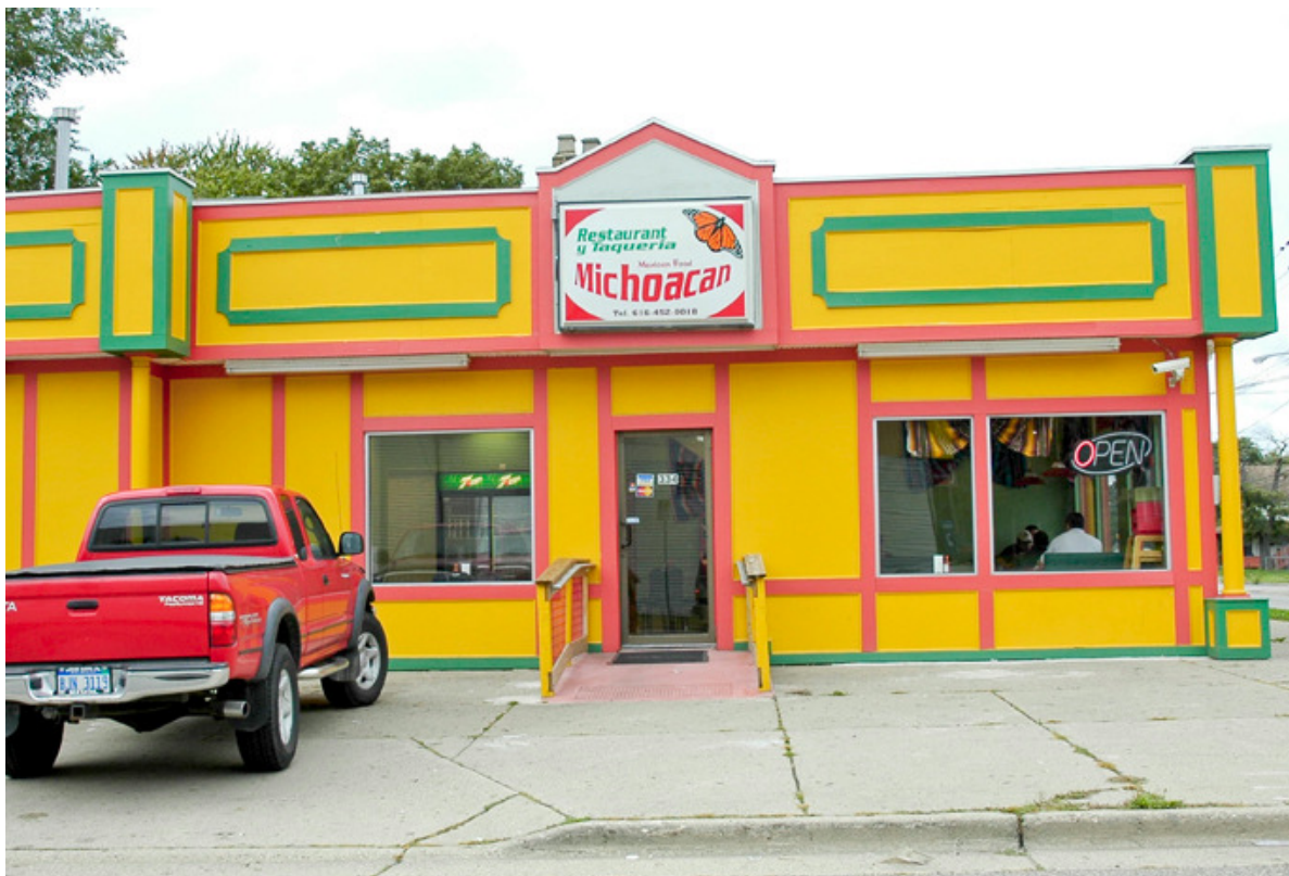
Restaurant Michoacan - Burton Heights